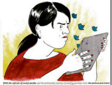
With the advent of social media and the facilitation of posting postings online, the poison pen letter has gone electronic and this has taken out much of its deadly sting. NET JIC

T he surat layang, a highly infectious "malicious rumor" spatch that assassinates a targeted person's character and once widely used in the 1930s and 1960s, has changed. This largely anonymous piece of written or printed text, which is often passed on by word of mouth, has taken on much of its deadly sting. This is so much so that the internet, working can be locally anonymous as the source of postings are often traced back to the person who made an almost anonymous post. This is so much so that the internet, working can be locally anonymous as the source of postings are often traced back to the person who made an almost anonymous post.