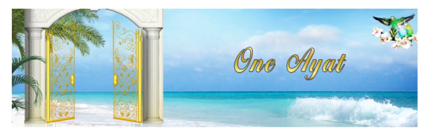
Your Lord expands the provision of anyone He wills and restricts it. He is aware of and sees His slaves. (Surat al-Isra, 30)