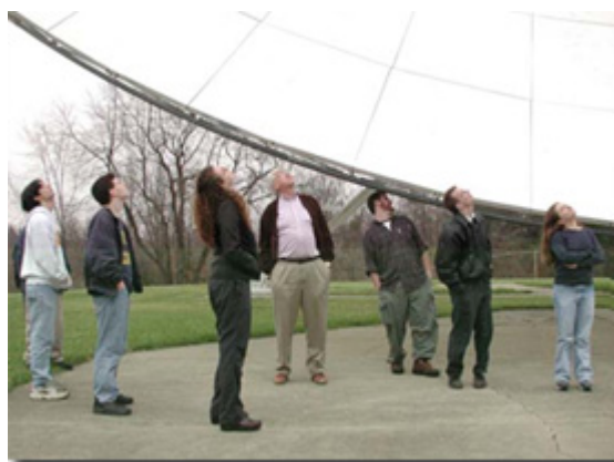
A radio telescope on Peach Mountain, in Dexter, Michigan

We gave Dawud great favor from Us: "O mountains and birds! Echo with him in his praise!" And We made iron malleable for him: (Surah Saba', 10)