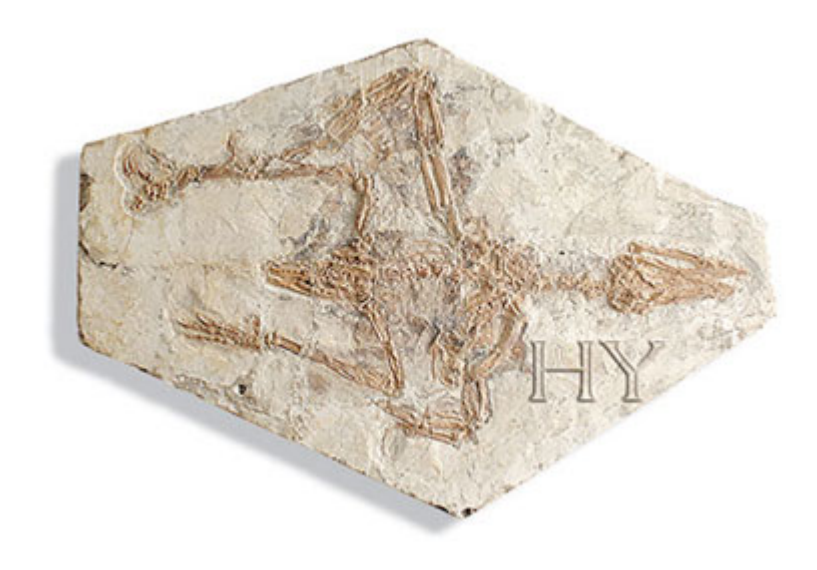
The perfect flying bird Confuciusornis , which lived in the same period as Archaeopteryx .

fossil in question in the copies of the Atlas of Creation in their possession. They can also obtain detailed information about the Archaeopteryx error here.