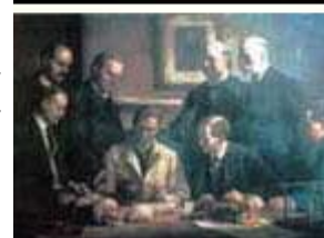
4) After 40 years of its discovery, the Piltdown fossil is shown to be a hoax by a group of researchers.