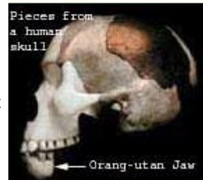
2) Pieces are reconstructed to form the famous skull.