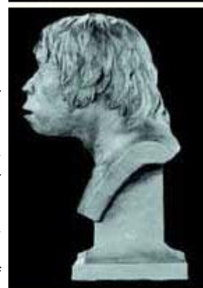
3) Based on the reconstructed skull, various drawings and sculptures are made, numerous articles and commentaries are written. The original skull is demonstrated in the British Museum.