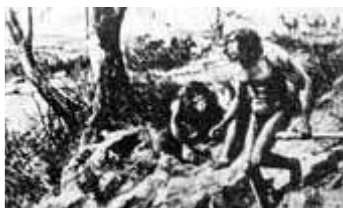
The picture on the left was drawn on the basis of a single tooth and it was published in the Illustrated London News magazine on July 24, 1922. However, the evolutionists were extremely disappointed when it was revealed that this tooth belonged neither to an ape-like creature nor to a man, but rather to an extinct pig species.

In 1922, Henry Fairfield Osborn, the director of the American Museum of Natural History, declared that he had found a fossil molar tooth belonging to the Pliocene period in western Nebraska near Snake Brook. This tooth allegedly bore common characteristics of both man and ape. An extensive scientific debate began surrounding this fossil, which came to be called "Nebraska man", in which some interpreted this tooth as belonging to Pithecanthropus erectus , while others claimed it was closer to human beings.