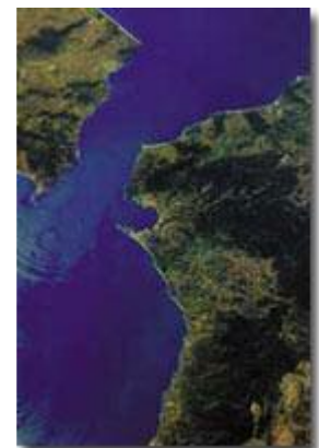
A satellite photograph of the Strait of Gibraltar.

(For further reference, please see, Miracles of the Qur'an , by Harun Yahya)