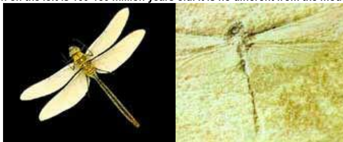
Today's dragonfly is exactly the same as the 135-million-year-old fossil on the left.