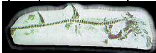
The shark, one of the most dangerous creatures in the sea, and the 400-million-year-old fossil below clearly show that there has been no evolutionary process.

All the fossil discoveries that have been made show that living things have undergone no evolutionary process, that they were created millions of years ago in just the same form as they are now, and that they had no evolutionary ancestors. This fact clearly shows that creation by evolution is quite out of the question.