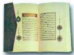
The Qur'an contains not one verse about creation being based on evolution.

It is evident that God, the Almighty, created the whole universe and life. It is His decision whether creation should be instantaneous or by stages. We can only understand how it happened by means of the information God has given us (in other words, from the verses of the Qur'an), and the scientific evidence apparent in nature. When we look at these two sources, we see no case for "creation by evolution."