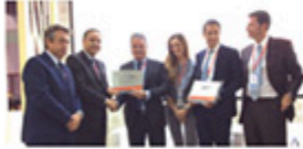
Gulf Helicopters AW fleet sets new operational milestones