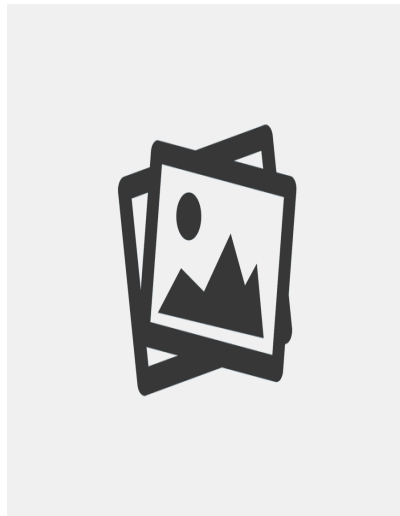
A fossil belonging to a Neanderthal

The Neanderthals emerged suddenly in Europe around 300,000 years ago, and disappeared, or else were assimilated by mixing with other human races, silently and just as quickly about 35,000 years ago. The only difference between them and present-day humans is that their skeletons are rather sturdier and their brain volumes slightly larger. Neanderthals were a well-built human race, as is now agreed by just about everyone.