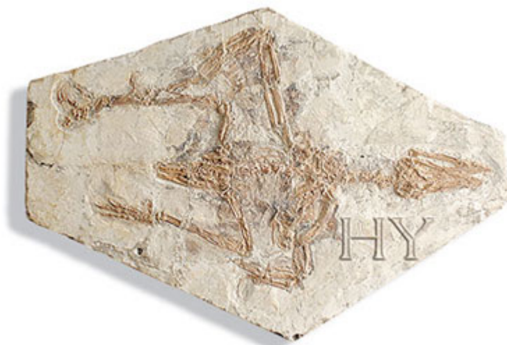
The perfect flying bird Confuciusornis , which lived in the same period as Archaeopteryx .

fossil in question in the copies of the Atlas of Creation in their possession. They can also obtain detailed information about the Archaeopteryx error here .